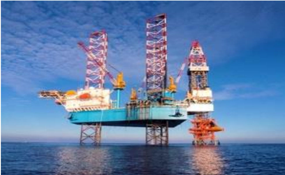
Cultivating marine pioneers of the future