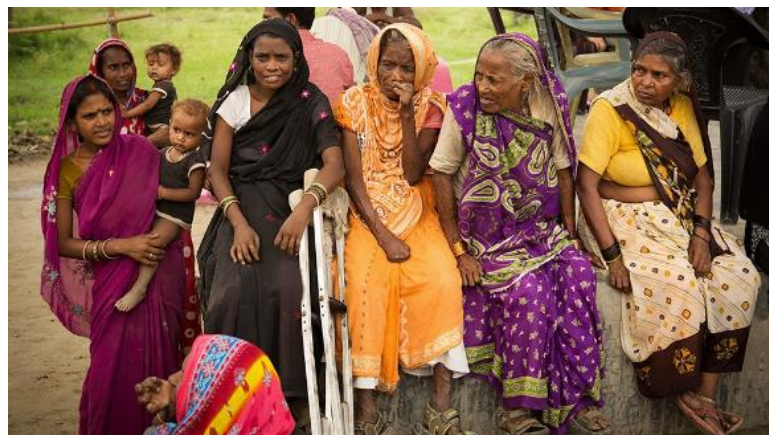
Elimination of Leprosy