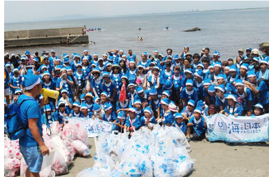
Promoting public awareness of the ocean